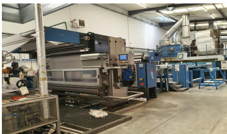
Fig. 1: Equipment for the treatment of textile materials - Squeezing Pader Machine

In the present paper, a thorough analysis of the materials used to make two types of mattress covers was carried out: one intended for domestic use and the other oriented towards the medical care regime. This analysis aimed to evaluate the quality, durability and technical characteristics of the materials used according to the specific requirements of each type of case, as well as to identify any differences in composition, treatments applied and performance.